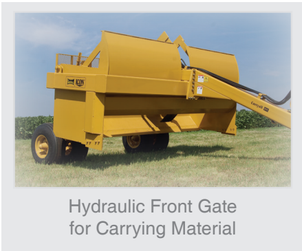
Hydraulic Front Gate for Carrying Material