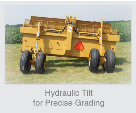
Hydraulic Tilt for Precise Grading