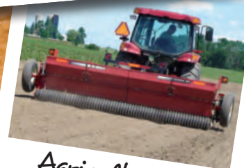
Agricultural & Landscape Seeders