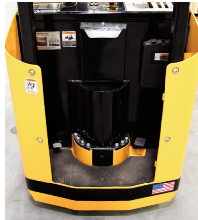
Low Step Height Operator Rear Entry