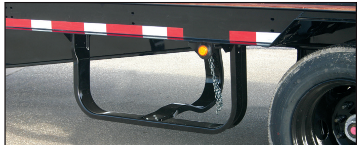
Spare Tire Carrier