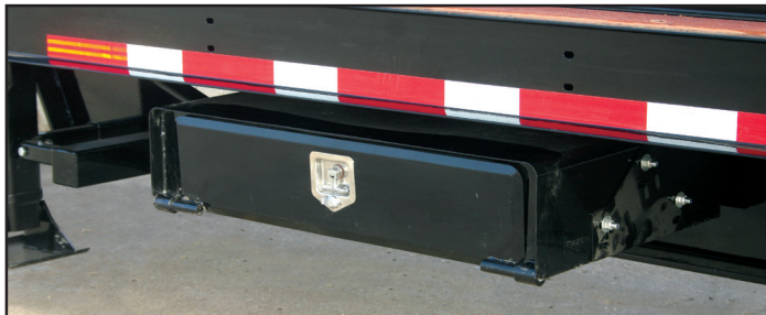
Under Deck Mount Toolbox