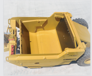
Smooth Interior for Excellent Clean Out