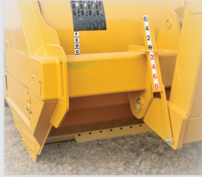
Front Gate with Indicator