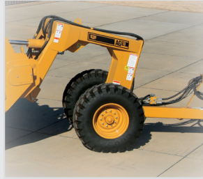
Exclusive Front Dolly