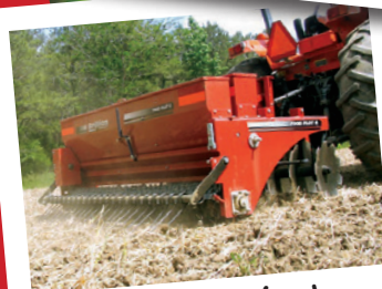
Food Plot Seeders