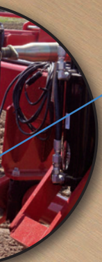
Operator's Manual Storage Canister