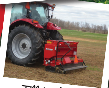
Till 'N Seed®