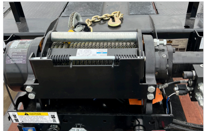
• 12,000 lb. or 20,000 lb. Planetary Winch