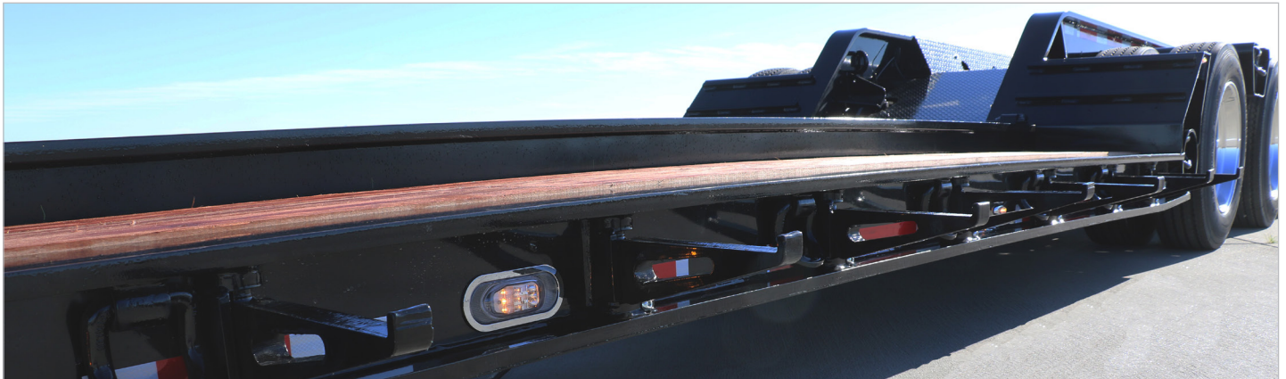
Drop Side Swingout Outriggers on 24" Centers