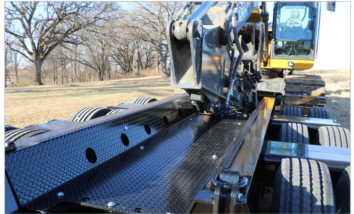
Boom Trough Cover Option