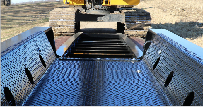
Boom Trough Cover Option