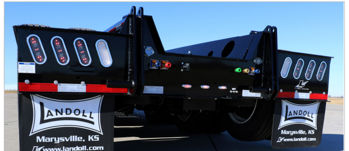
Flip Axle Ready Connections Turn / Tail, 2 Stop / Tail, Strobe Light