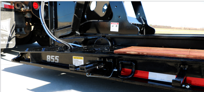
Removable Double Outrigger