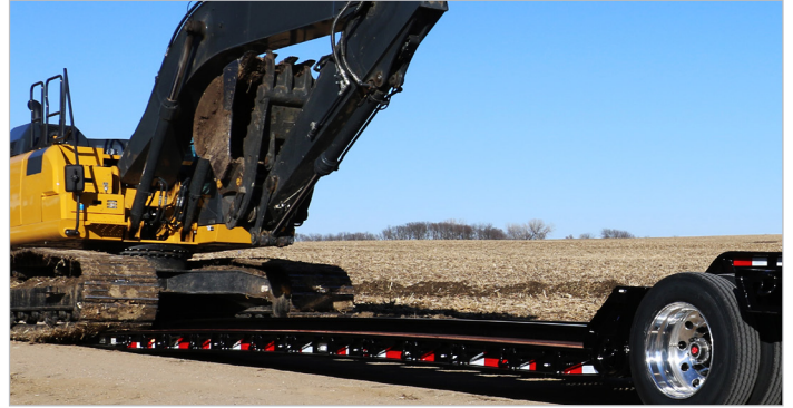
Drop Side to Reduce Weight for Tall Loads