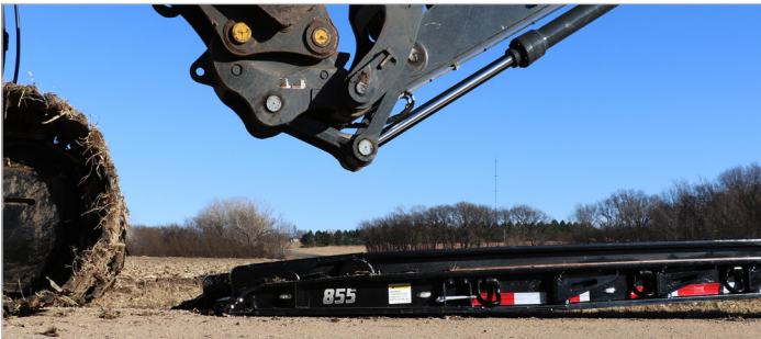
Low Access Approach