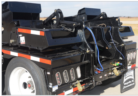
Spring Lock Fin