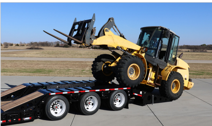
Bolt-On Single Piece Wheel Covers with Traction Bars