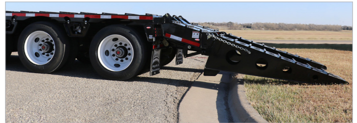
Pin-On Beaver tail, Manual Flip (Pin-On Attachment to Flip Axle Brackets)