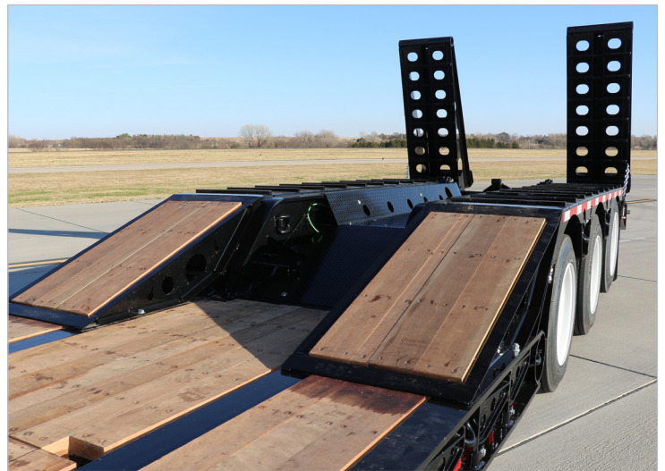
Optional Bucket Trough Filler Optional Trunnion Slope Ramps (Track)