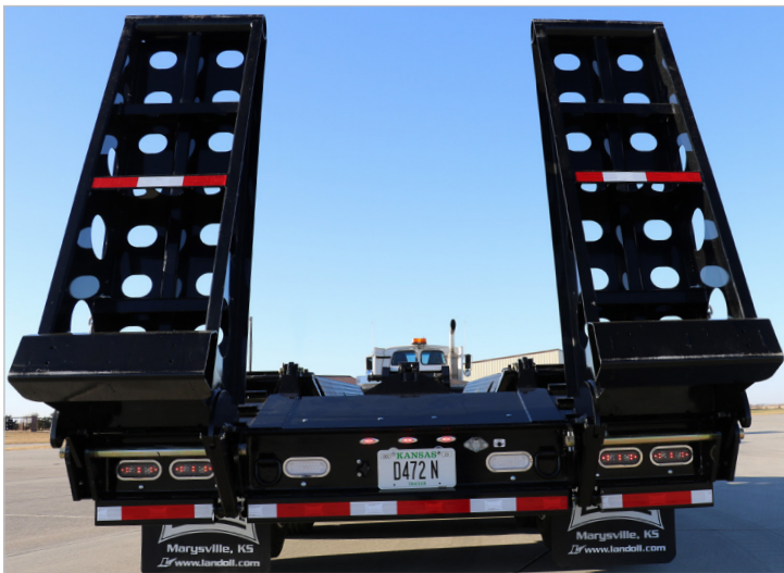
5" Wide Heavy Duty Beavertail Ramps (Hydraulic Assist Shown)