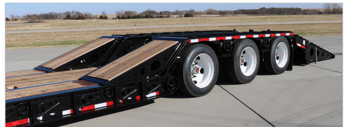
Pin-On Beaver tail, Hydraulic Flip (Pin-On Attachment to Flip Axle Brackets) – Hydraulic Brackets Required Heavy Duty Ramps – Optional Hydraulic Raise/Lower with Either Beaver tail Option