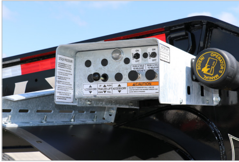
Gooseneck Control Station (Galvanized Standard)