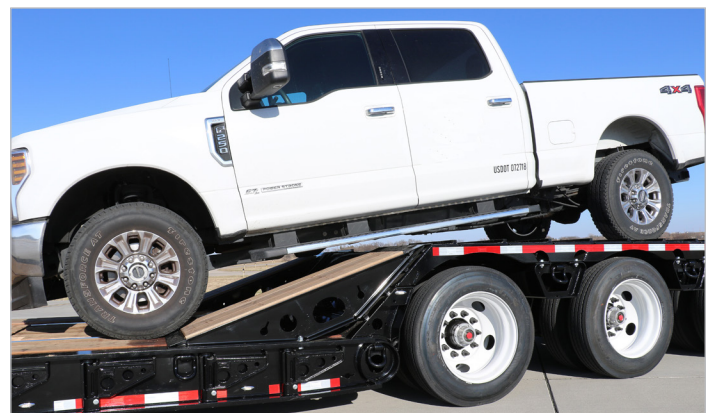
Optional Trunnion Slope Ramp Track Area or Full Width