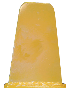
9" x 3" Teeth - 3" x 3" Top