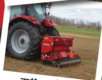
Till 'N Seed®