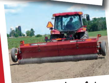
Agricultural & Landscape Seeders