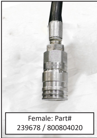
Female: Part# 239678 / 800804020