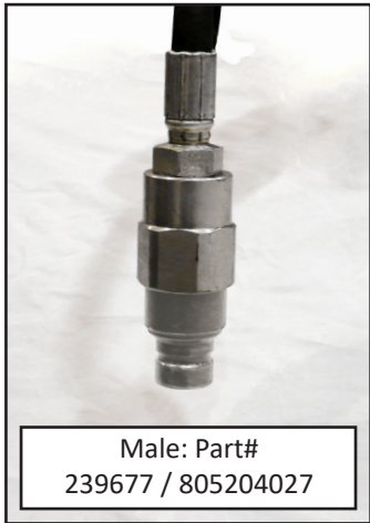
Male: Part# 239677 / 805204027